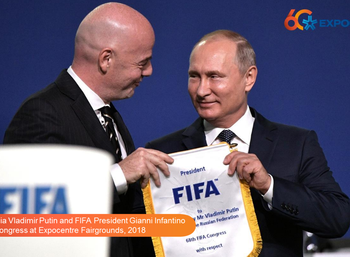
President of Russia Vladimir Putin and FIFA President Gianni Infantino at the 68 th FIFA Congress at Expocentre Fairgrounds, 2018